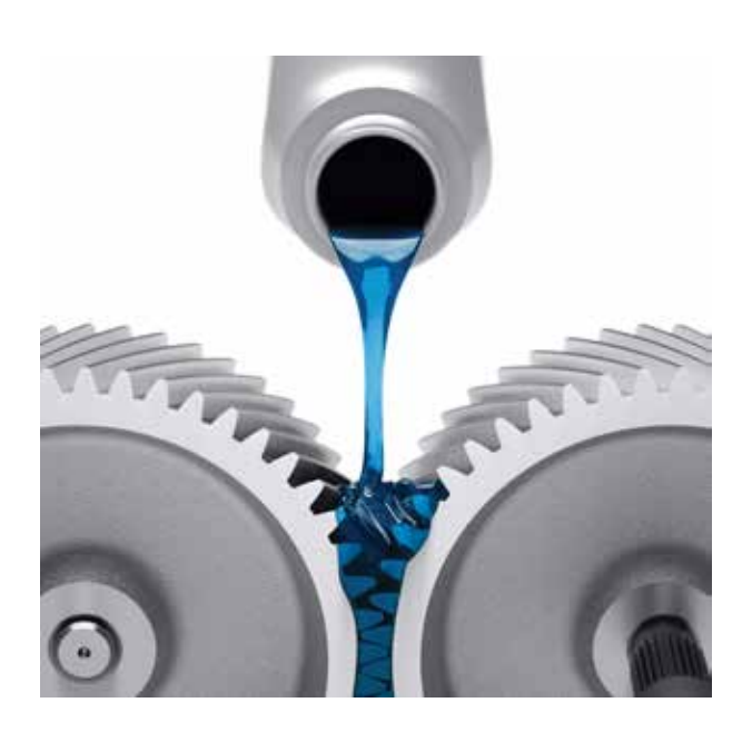
AERZEN special lubricants - always the right choice