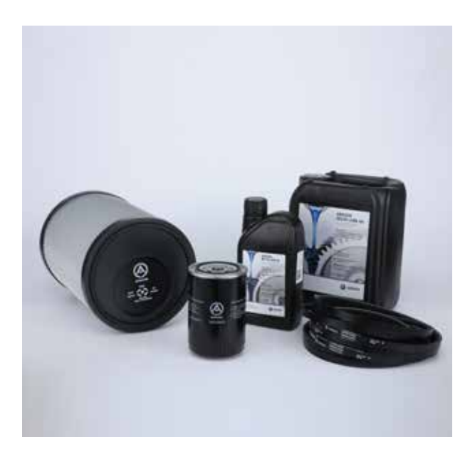
Spare parts from AERZEN. Quality that pays for itself

At AERZEN, we regard after-sales as a key factor in achieving optimum longevity of our machines. Therefore from original spare parts, lubricanting oil to maintenance contracts are very important to avoid experimentation!