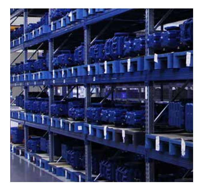
Replacement stages in APAC stock