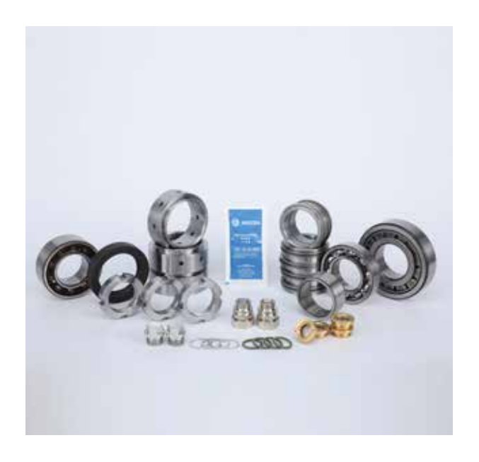
AERZEN service kits - always the right choice