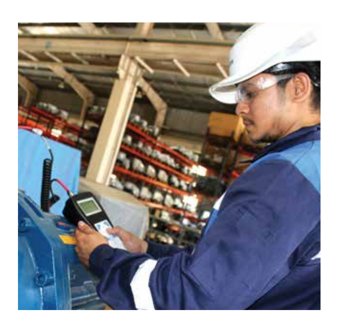
Everything at a glance with our customise bearing detector