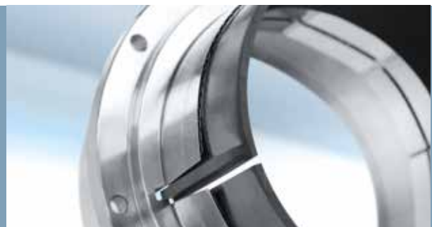
Air foil bearings with bump foil

But an uninterruptible power supply only offers the necessary safety if it is really safely available. Therefore, sophisticated load cycles are as necessary, as the regular exchange of the battery cells within a fixed maintenance plan. Consequently, an uninterruptible power supply inevitably increases the life-cycle costs. A similar expenditure is necessary for the magnetic bearing system, as - permanently in operation - it uses electrical energy continuously. Its complex regulation technology necessitates regular maintenance intervals. In comparison, air foil bearings, with their energetically adjusted no-load operation, are maintenance-free and can be changed very easily at site during plannable revisions of the blower technology in case of need due to their simple construction. Moreover, expert opinions confirmed that the total amount of service costs in connection with an air foil bearing is considerably less, as the design of the system is more simple and service providers are available locally. This detail finally leads to an increase of the availability of the turbo blowers - an aspect which becomes important at the latest when concerning the design and modernisation of e.g. wastewater treatment plants the provision of redundant systems is considered.