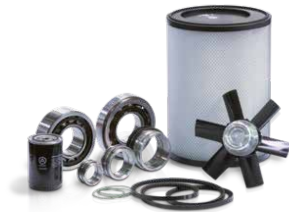
Spare parts from AERZEN. Quality that pays off