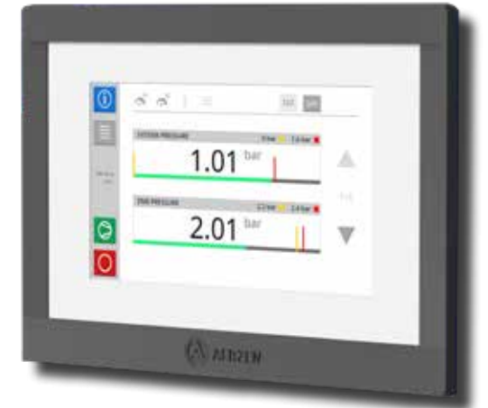
The intuitive touch panel of the new AERtronic