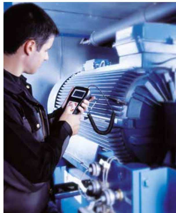
Professional data evaluation with the AERZEN Detector