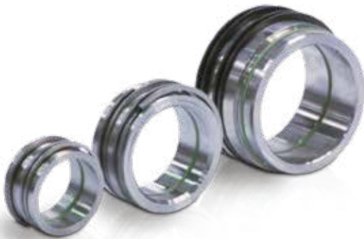
AERZEN Service Kit is always a good choice