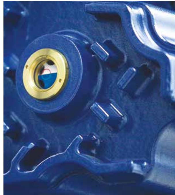
AERZEN special oils ensure correct lubrication