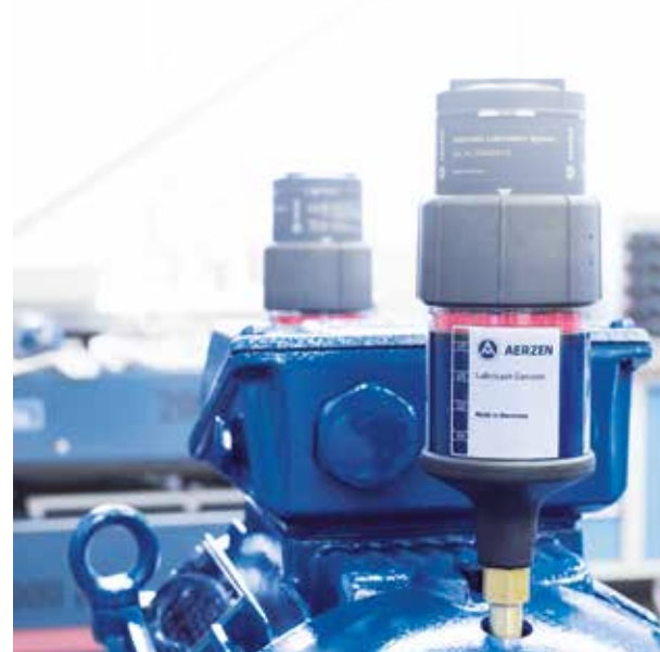
Minimises the risk of failure – AERZEN automatic re-lubrication systems

System Control: Re-lubrication over service life without danger of over- or undergreasing. Power supply via preconfigured and parameterised AERtronic. Output of fault message at higher viscosity or empty cartridge.