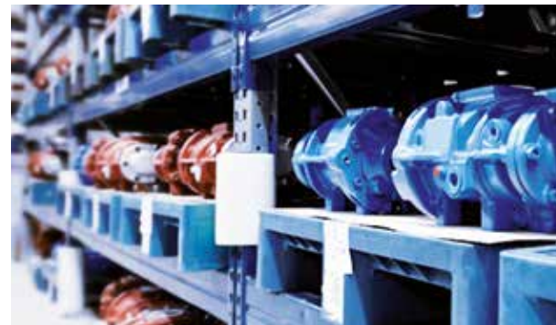
Stage Pool – your problem solution with 18 months warranty

Versatile and future-oriented service solutions for every area of application.