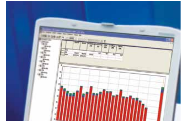
Acoustic investigation with 360 degree view

We carry out acoustic evaluations for you in the planning and project planning phase or carry out acoustic optimisations for existing plants.