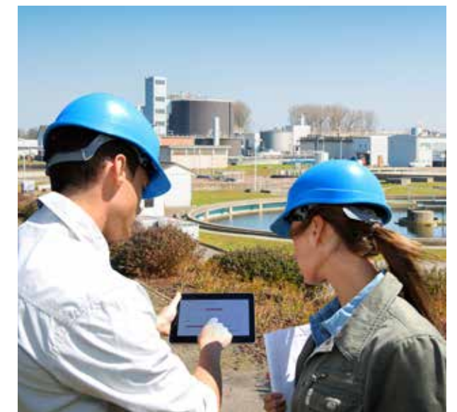
AERZEN WebView saves costs through need-based maintenance