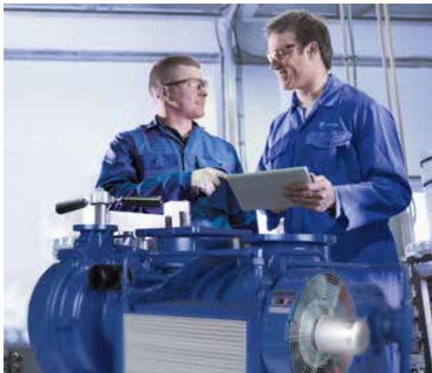
Trainings are the key to success

The trainings offered refer to the AERZEN standard assemblies: Delta Blower, Delta Hybrid and Delta Screw. The courses are practice-oriented and also include assembly accessories.