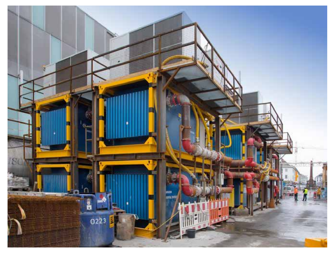
Seasonal air requirement or long-term rental? Or in need of maintenance, testing, or campaigns lasting only a few weeks up to production for a few years? AERZEN RENTAL offers highly economical solutions for almost any requirement.

If you maintain production for only a few weeks or a few months each year, Aerzen Rental is always close by and stands ready to support you. We can set up temporary waste water treatment systems to allow you treat the excess during seasonal demands, like harvest and touristic seasons. Sugar fabric, waste water plants in wine or touristics areas have already trusted Aerzen Rental to meet their increase of capacity during their peak of production.