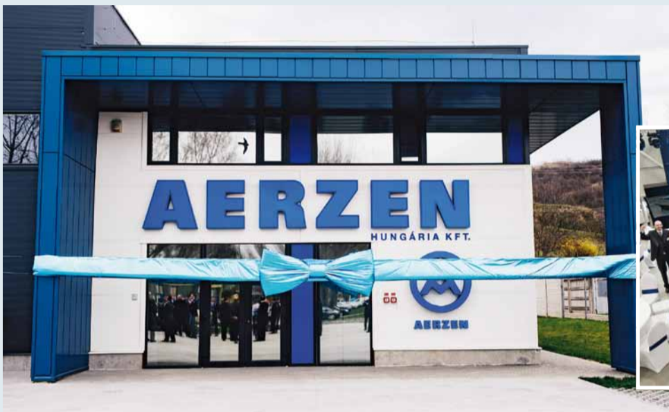
A toast to the new building and the new location of the process gas division.

Afterwards, everyone enjoyed a buffet, live music and various shows. In numerous conversations the efficiency of the new location was mentioned – something which is apparent from the types of projects which it is now capable of handling. ○