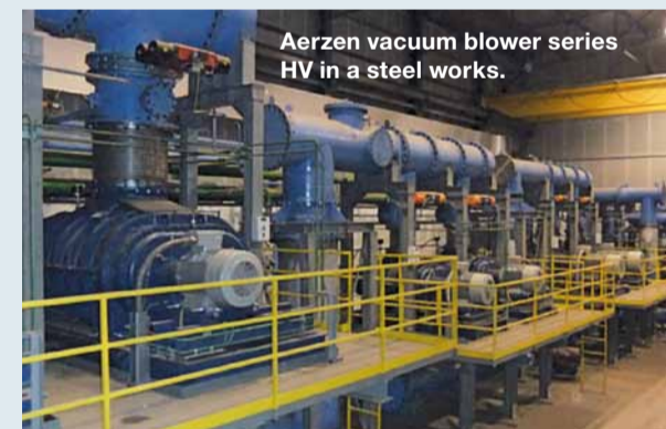
Aerzen vacuum blower series HV in a steel works.

Aerzener Maschinenfabrik has been well-represented in these applications for over 60 years with the large Roots Blowers. Energy saving and an improvement in the environmental balance are the main focus worldwide. Applications for production of vacuum with dry-compressing vacuum blowers are divided into three areas: