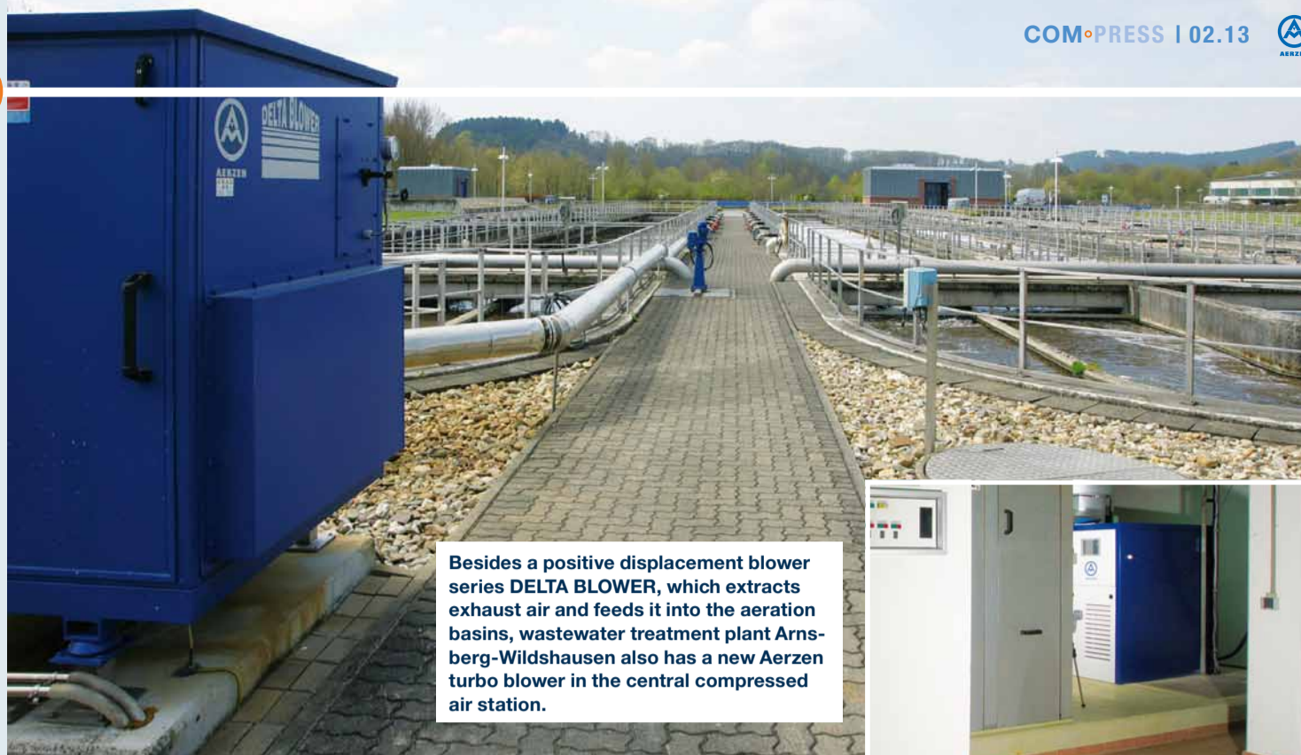
Besides a positive displacement blower series DELTA BLOWER, which extracts exhaust air and feeds it into the aeration basins, wastewater treatment plant Arnsberg-Wildshausen also has a new Aerzen turbo blower in the central compressed air station.