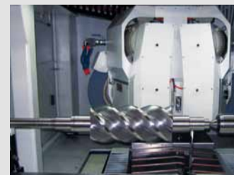
The new Danobat machine grinds compressor rotors to micrometre accuracy.

The production facility in Aerzen deployed a new CNC-external cylindrical grinding machine, made by Messrs. Danobat, at the beginning of the year. It is equipped with three CNC-main axes (X, Z, B) as well as further axes for the workpiece drive, and an "in-process measuring system" through which it is possible to grind to micrometre accuracy. The control of the machine, Siemens 840 D Solution Line, was supplemented by a special Danobat user interface. Danobat, located in the north of Spain, near Bilbao, is part of the Danobat Group, and also demonstrates its considerable skill in innovation, in other technologies.