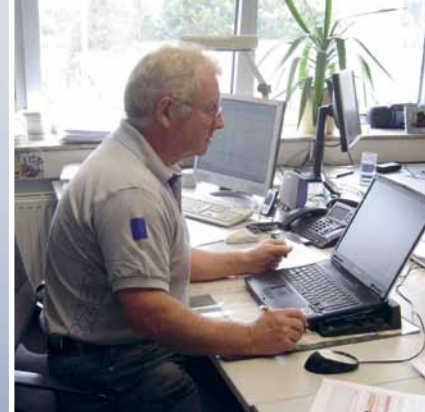
In Aerzen all the measured values are collected and checked.