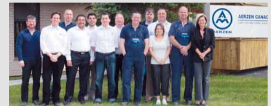
The colleagues of the sales company in front of the head office.

The Canadian Aerzen subsidiary Aerzen Canada Inc., located in Vaudreuil near Montréal, will celebrate its 25th anniversary this year. The company, which was founded in 1987, has developed over the years from a sales office with three employees to a country-wide networked sales company which also has facilities for assembly and repair.