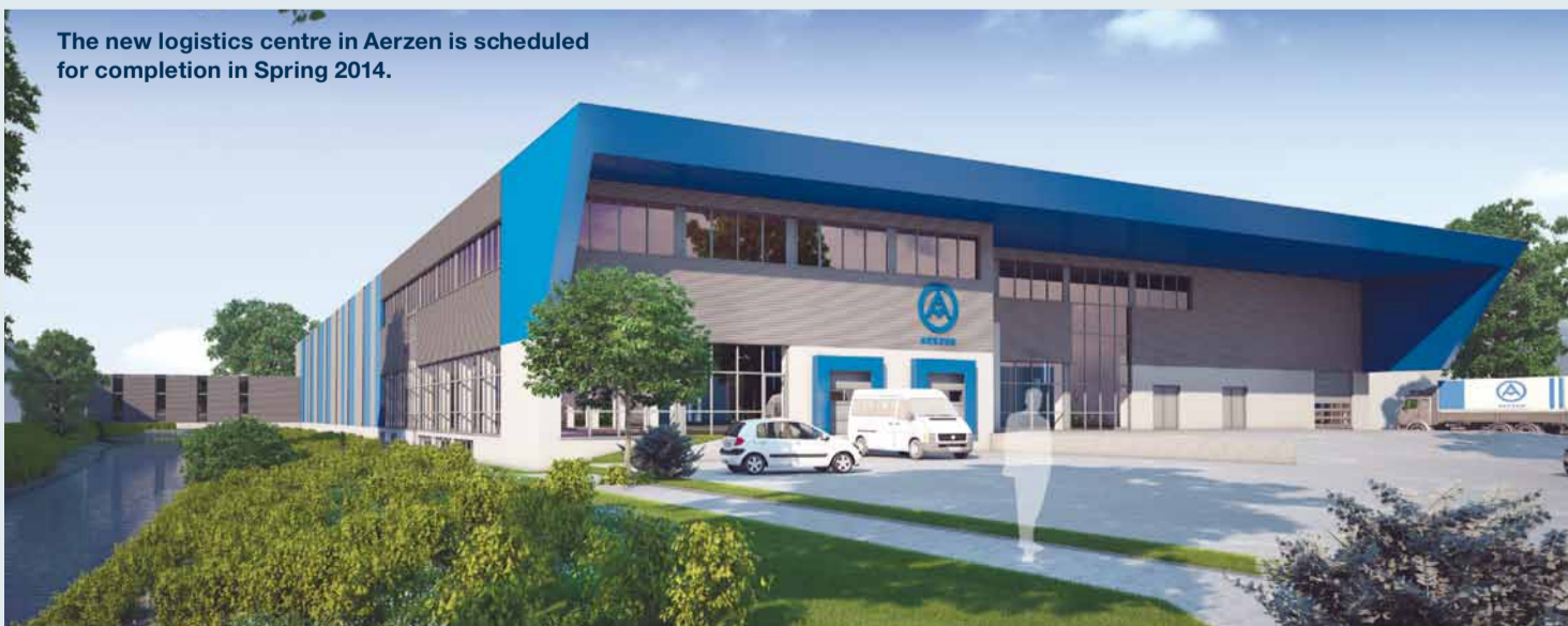
The new logistics centre in Aerzen is scheduled for completion in Spring 2014.

Further plans over the medium term include the construction of a new high-bay storage facility and also a new After Sales Centre. ○