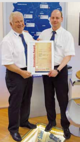
At the PowTech fair Aerzener Maschinenfabrik received a certificate for being nominated for the Innovation Award.

In 2012 Aerzener Maschinenfabrik was able to win the Innovation Award with Delta Hybrid in the apparatus construction and process components category.