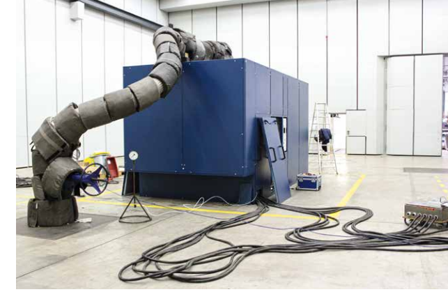
The Delta Screw package VML 250 during the function test in the AERZEN Acoustics Hall

fold. As there was no frequency converter with sufficient power available, the machine was started in parallel with the diesel generator, which slowly pulled the electric motor up to speed.