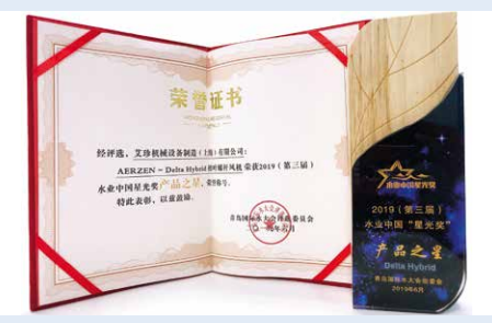
Aerzen China was awarded with the "Star of Product" at the 14th International Water Conference

Aerzen China participated for the second time in the water conference in Qingdao and has already confirmed its participation for the next year. More than 2,500 participants showed great interest in the company's energy-saving solutions and products. The China Association for Science and Technology and the Qingdao Municipal People's Government are the hosts of the event.