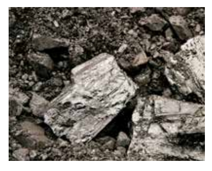
Figure 2: Bulk goods contaminated with oil during the pneumatic conveying process