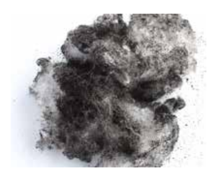
Figure 1: Deposits in bulk material, which collect in silencers with absorption material

With this certification for all machines (Delta Blower, Delta Hybrid, Delta Screw), Aerzener Maschinenfabrik GmbH takes an important step towards the quality assurance of oil-free operating air as used for the generation of compressed air within various processes and applications in the aforementioned industries.