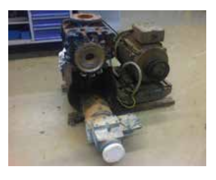
Image 3: Burnt compressor system after sparking occured in the blower